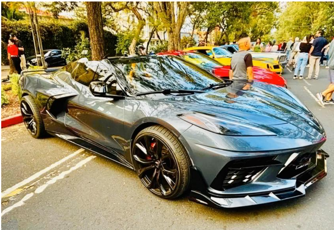
Photo of Guatemala Corvette Club get together. Less winter more driving.