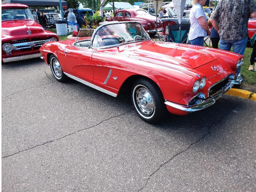
C1 Fuelie Corvette, Unknown Owner, BTT50's, June 23, 2024