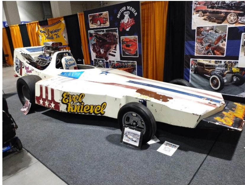
Evel Knievel Drag Car, BTT50's, June 23, 2024