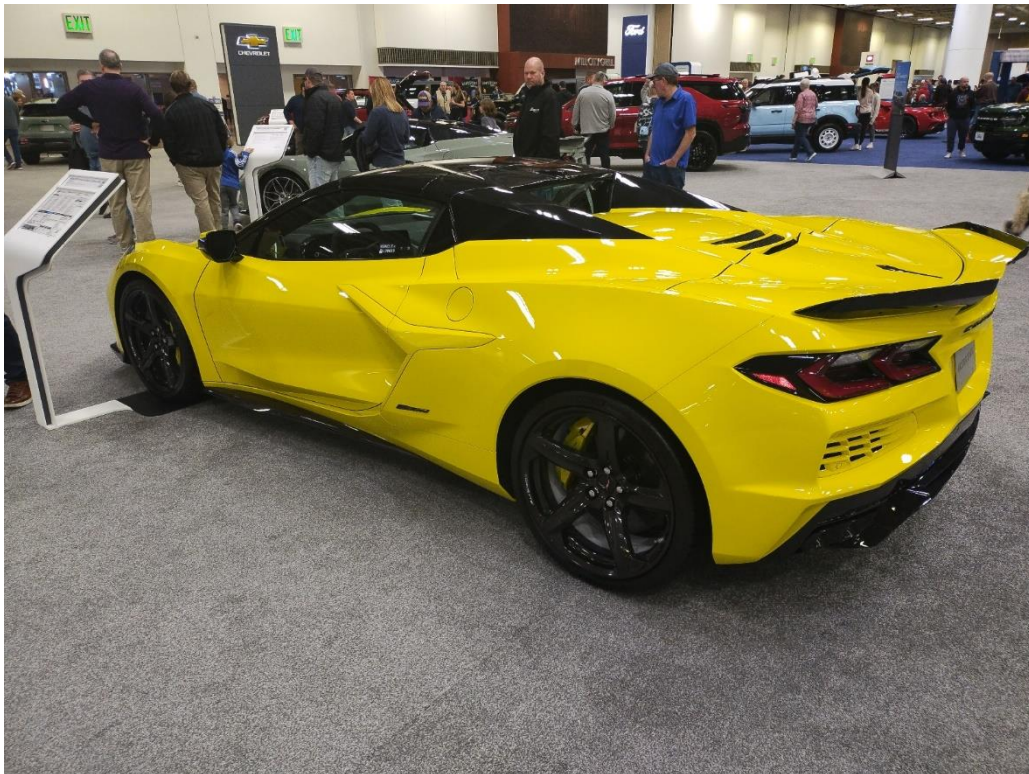
2024 Corvette E-Ray, 2024 MSP Auto Show