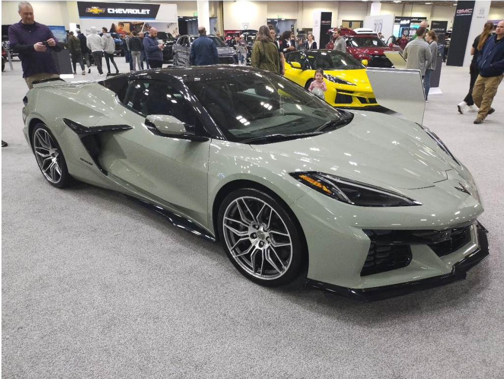
2024 Corvette Z06, 2024 MSP Auto Show