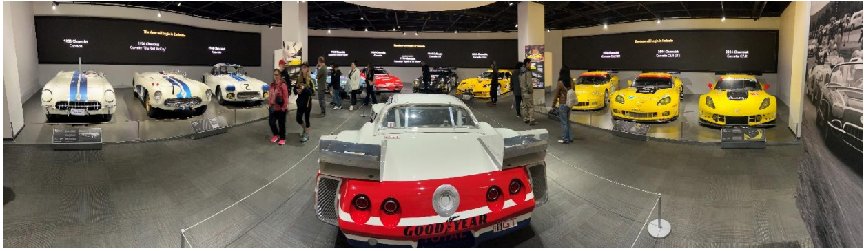
Photo of all units on display