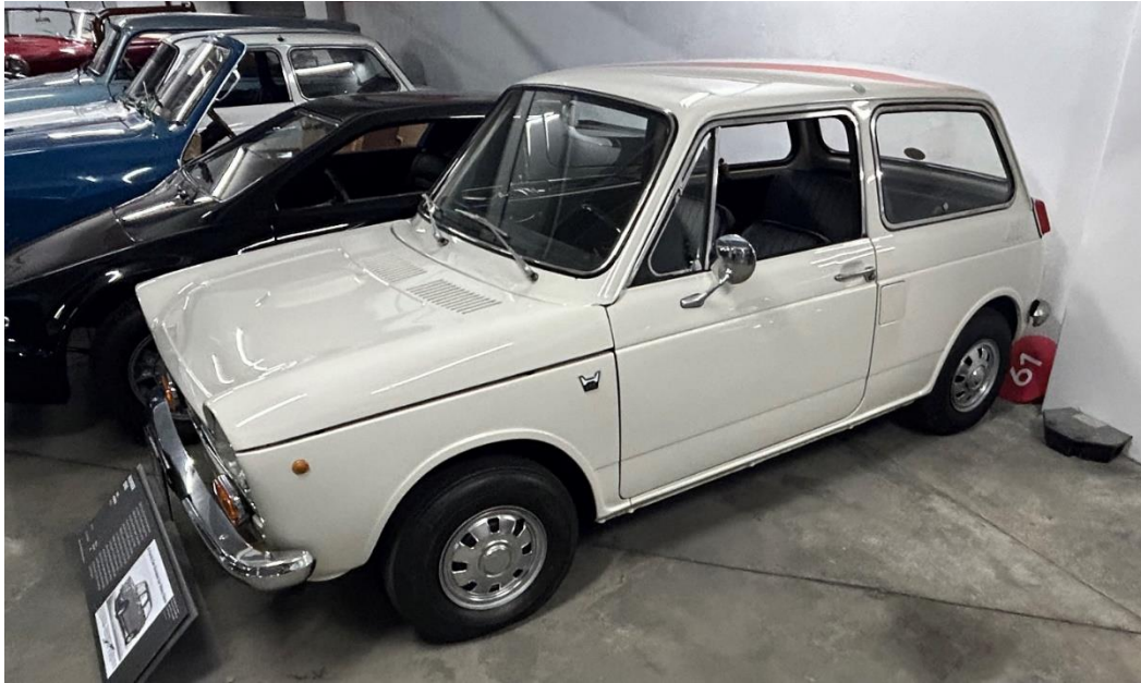
First ever USA Honda 1967 N600