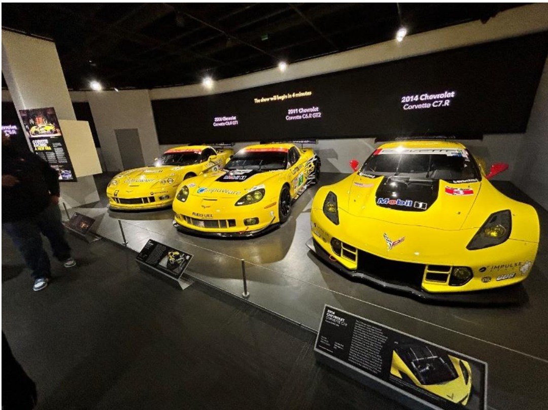
C6, C6 Wide Body, and C7 Race Cars