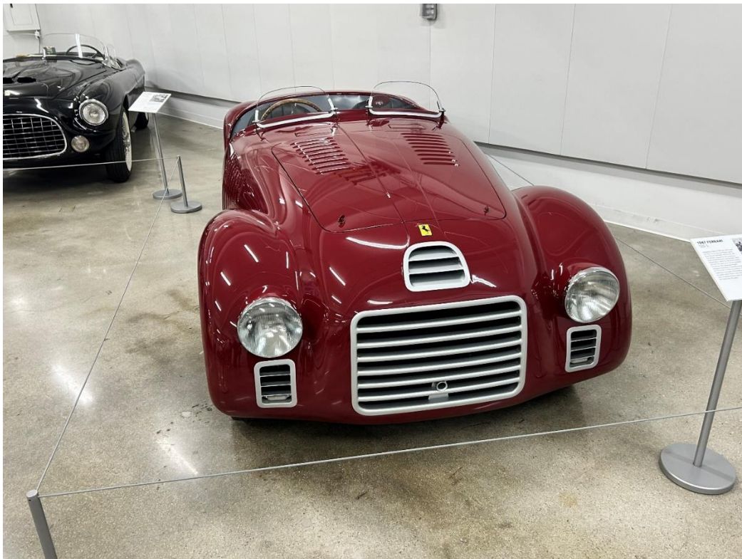
Serial Number 1 Ferrari