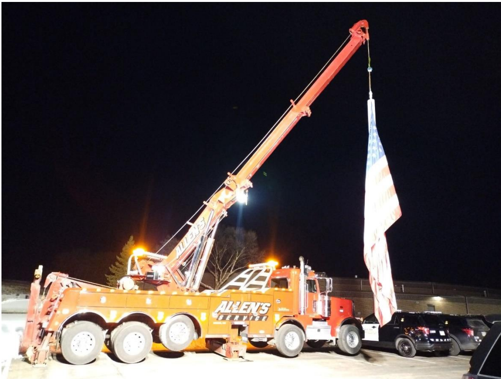
Tow Truck with Flag Memorial in Burnsville, MN, February 18, 2024