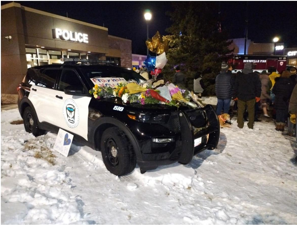
Burnsville Police Cruiser Memorial in Burnsville, MN, February 18, 2024