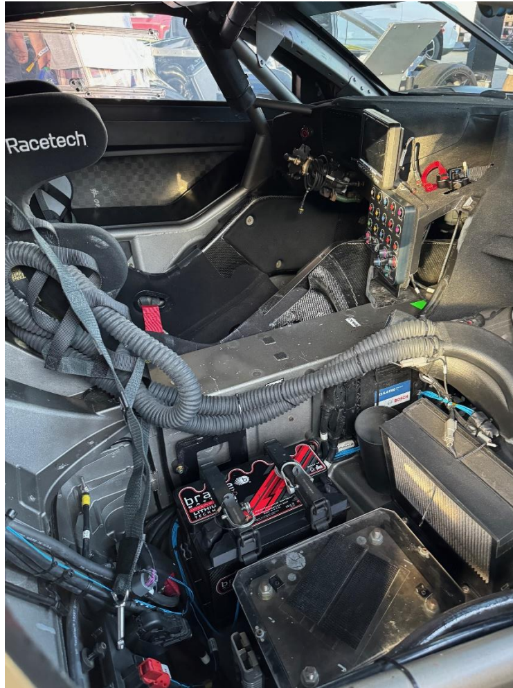
Inside of the Corvette Race Car