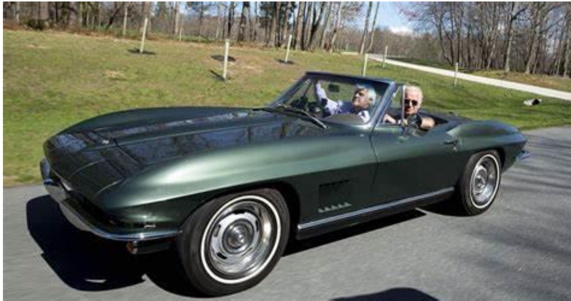
Joe Biden and Jay Leno, 1967 Corvette Roadster