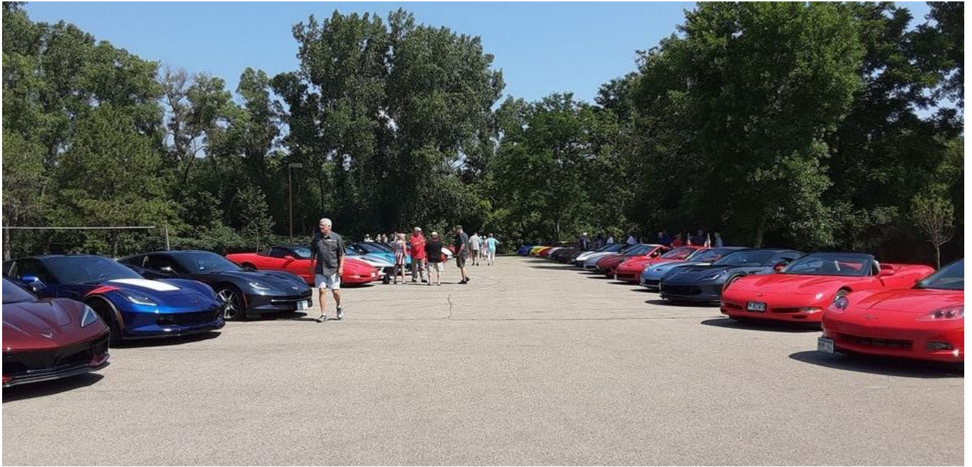
Staging area for Firecracker Cruise