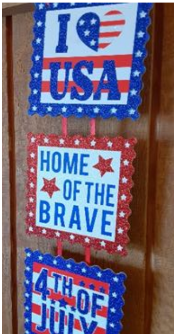
Do we need to explain?