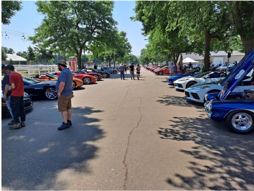
2023 GMCCA Car Show, Corvette Row MN State Fair Grounds, June 4, 2023