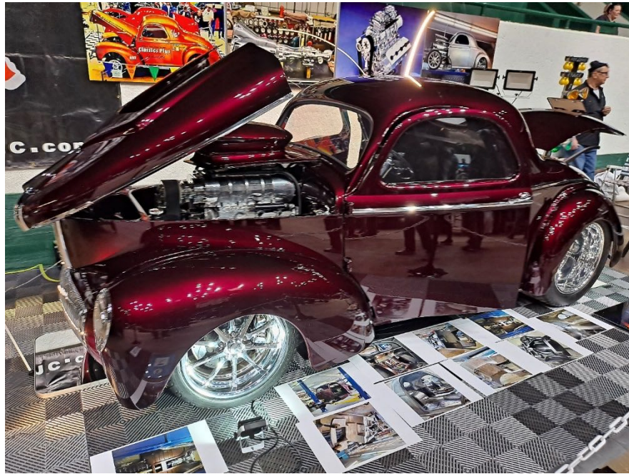
Willys Street Rod built by Classics Plus, Inc., Savage, MN