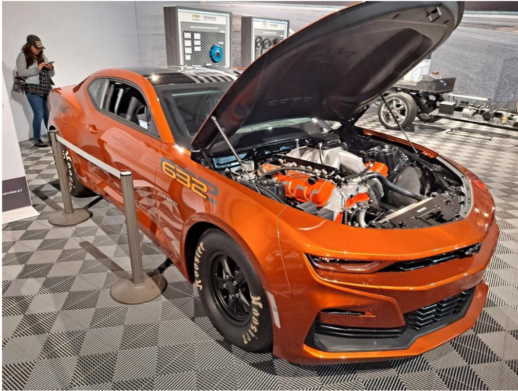
2023 Chevrolet Camaro "632 COPO"