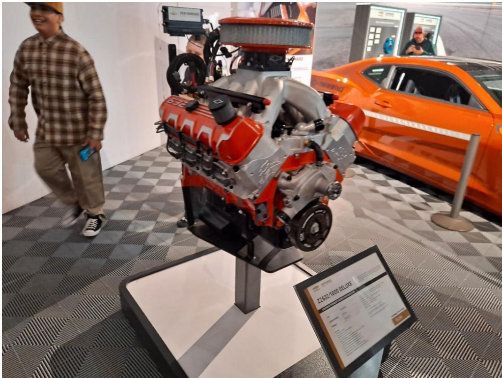
Chevrolet Crate 632 CI Big Block Engine