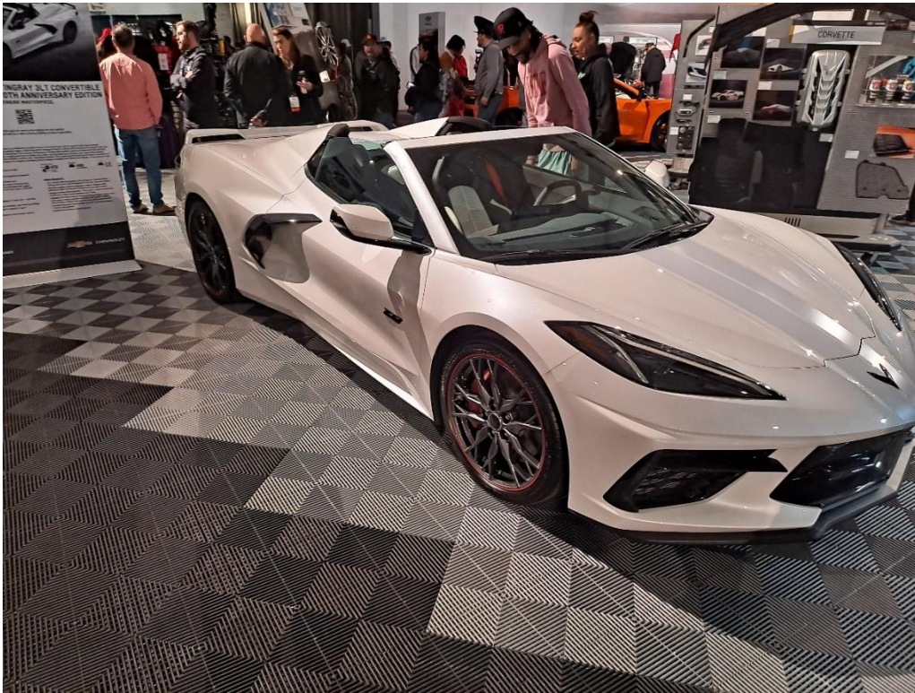
2023 Corvette 70 th Anniversary Edition