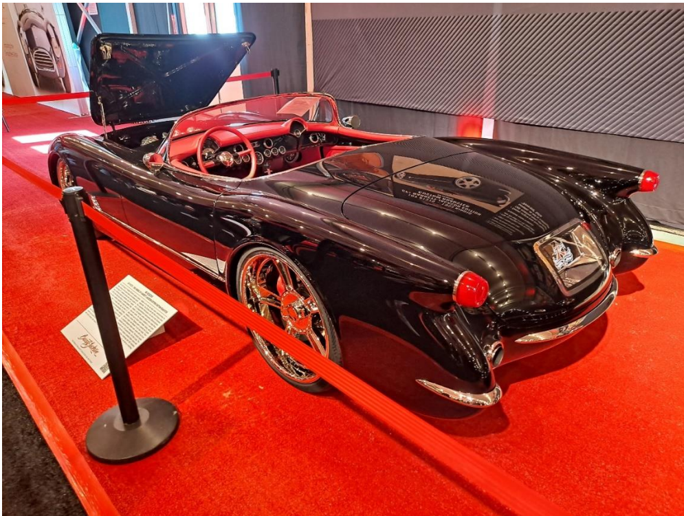
2023 Kindig Design CF1, 1953 "Style" Corvette. Sold at auction for $572,000!