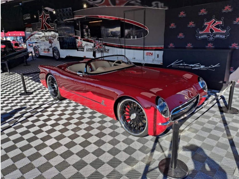
2023 Kindig Design CF1, 1953 "Style" Corvette