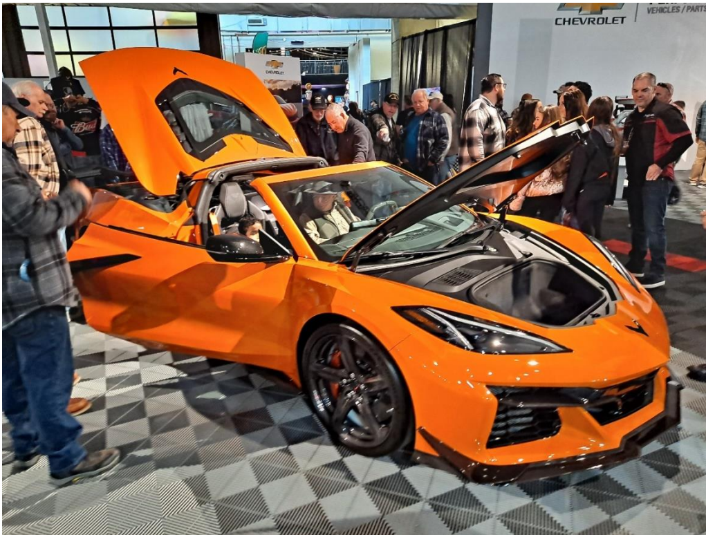
2023 Corvette Z06